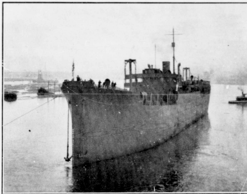
SS. "WAR CHARGER" PASSING OUT OF FALSE CREEK FOR HER OFFICIAL TRIALS