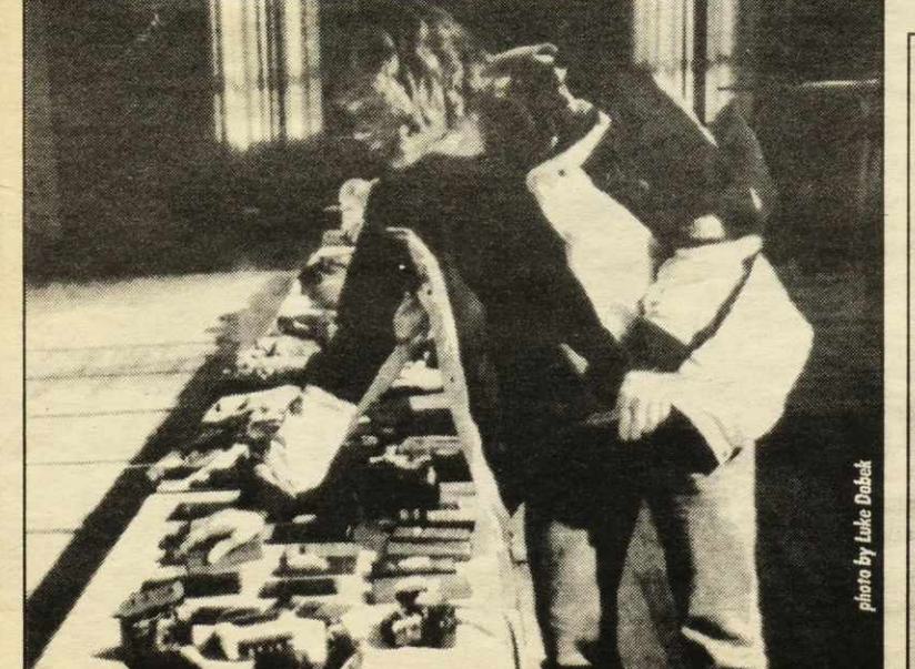
LOST AND SOLD: homeless artifacts auctioned off to new owners.

"Personally, I'm looking forward to working with her.'