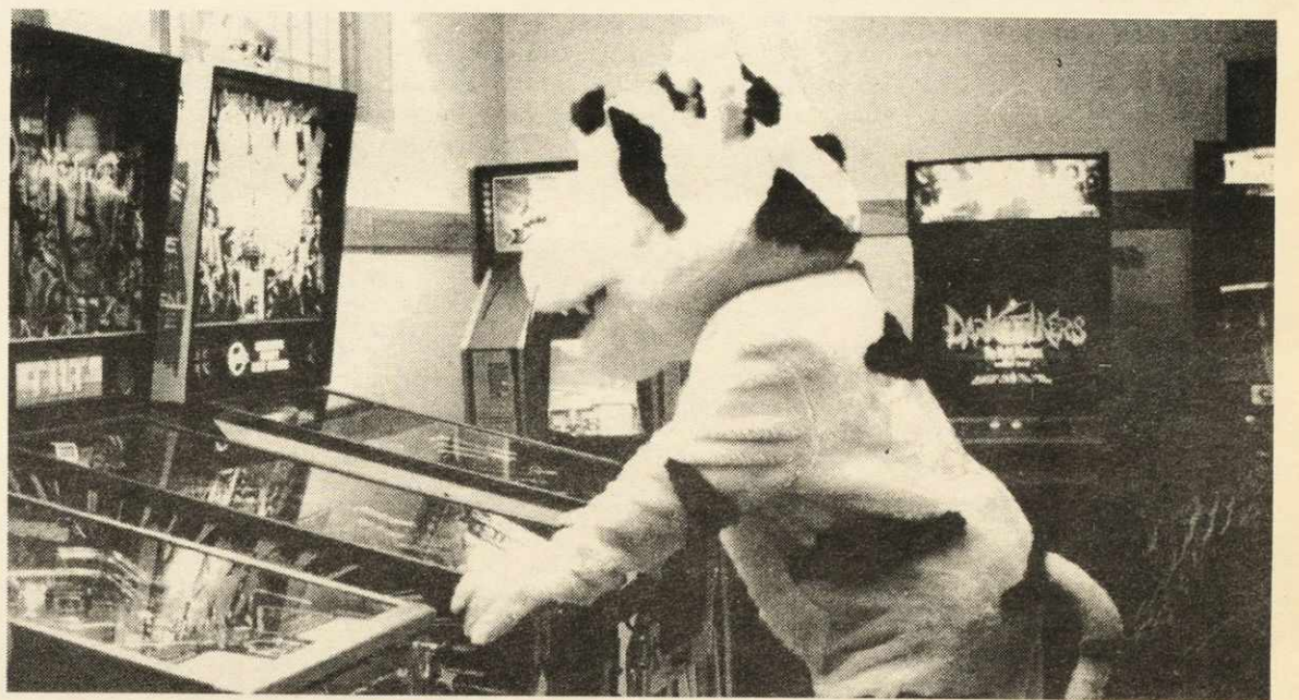
Ever since he was a young cub he played the silver ball / From Robie down to Creighton / He must've played 'em all / But I've never seen nothin' like him in any amusement hall / That black-striped tiger sure played a mean pinball...