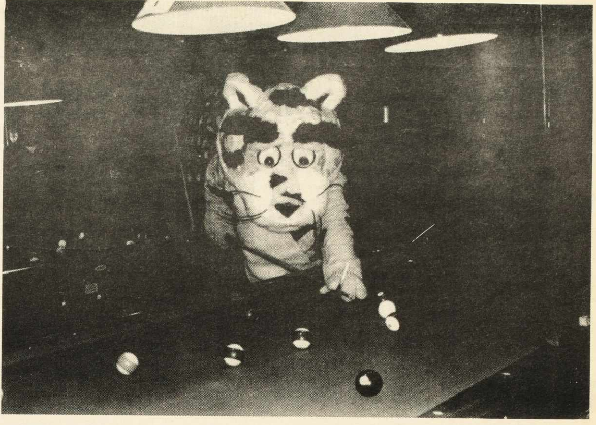
Ned lines up for a bank shot into the corner pocket

MAKE-UP: STEVE TONNER