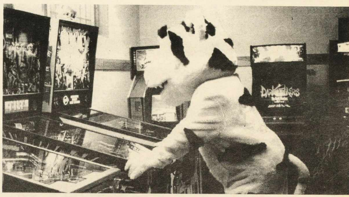
Ever since he was a young cub he played the silver ball / From Robie down to Creighton / He must've played 'em all / But I've never seen nothin' like him in any amusement hall / That black-striped tiger sure played a mean pinball...