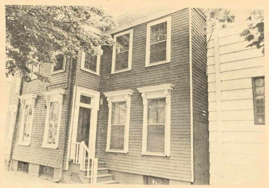
The student housing next to the SUB on University Avenue may be taken over by the administration next year. Over 60 Dalhousie students presently live in the buildings.