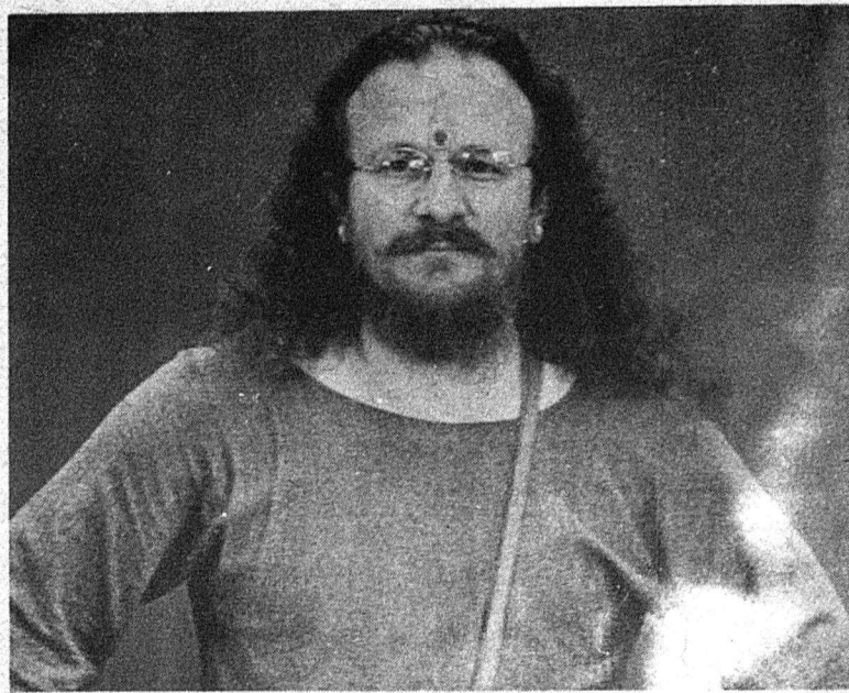
Manwoman reveals the secret of total unity.