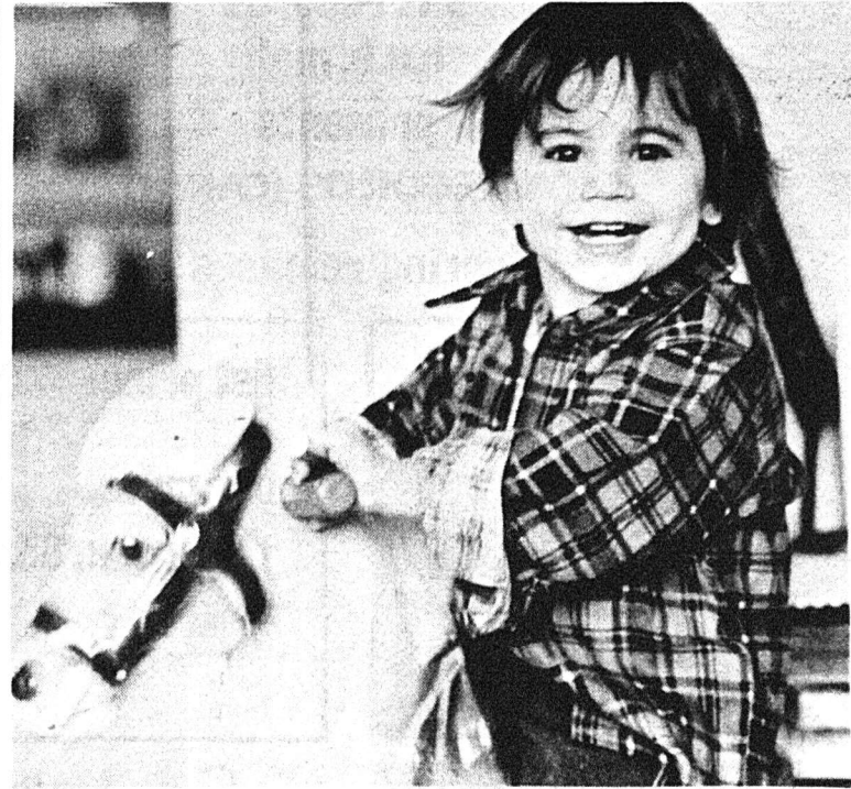
The UAB won't take you for a ride.