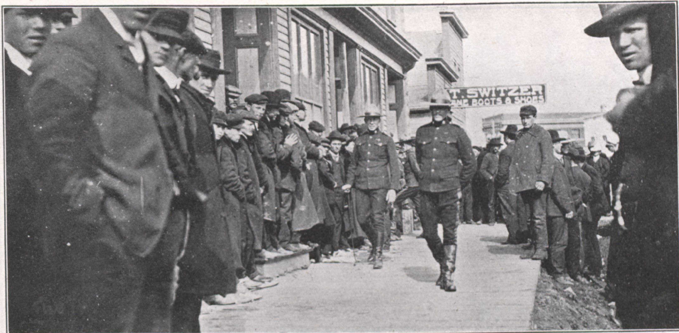
Keeping the Crowd Back, Doukhobor Lands Rush, Yorkton.