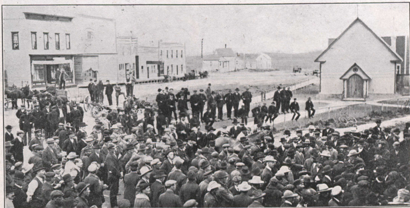
The Mayor's Speech during the Doukhobor Land Rush, Yorkton.