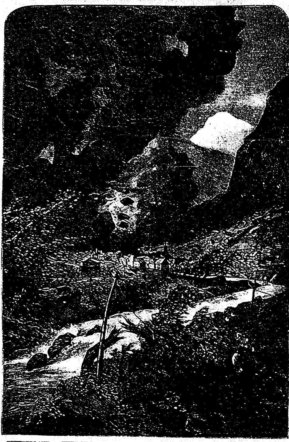
SWITZERLAND.—VIEW OF THE BERNSE VALLEY DURING THE LAND-SLIP OF SEPT. 11TH.

The following are our advertising rates:—For one monthly insertion, 10 cts. per line; for three months, 9 cts. per line; for six months, 8 cts. per line; for one year, 7 cts. per line; one page of illustration, including one column description, $30; half-page of illustration, including half-column description, $20; quarter-page of illustration, including quarter-column description, $10. 10 per cent. off on cash payments.