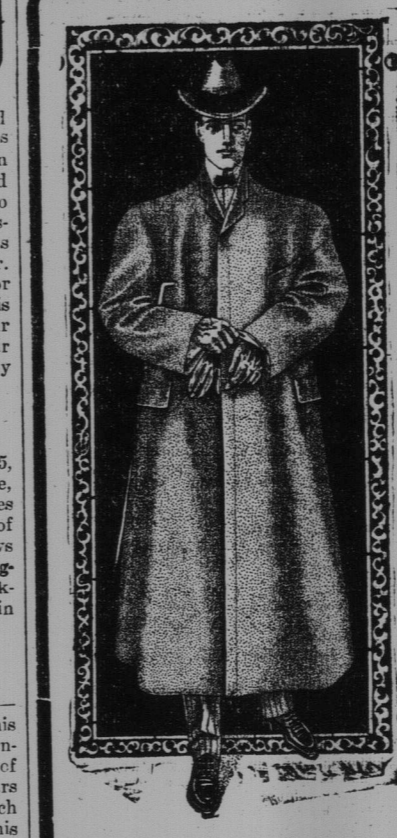
MANCHESTER ROBERTSON ALLISON, LIMITED, - - ST. JOHN, N. B.