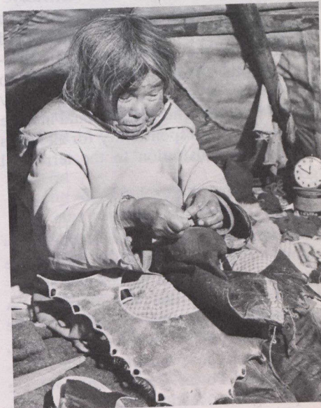
An Inuk woman repairs a leather moccasin. Northern Affairs Minister Epp has proposed measures for economic and political development of the North.

"We are encouraging new initiatives with native groups in an attempt to break the log jam of recent years and to move deliberately to achieve equitable land claims