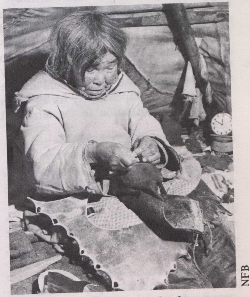
An Inuk woman repairs a leather moccasin. Northern Affairs Minister Epp has proposed measures for economic and political development of the North.

New initiatives to break the "log jam" of recent years and reach settlements in various land claims negotiations;