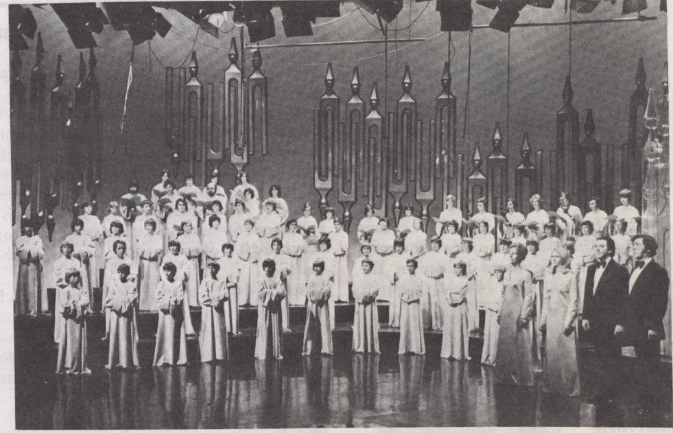
Les Petits Chanteurs, seen in concert (above), have made eight recordings.

Les Petits Chanteurs have given several live concerts, and radio and television broadcasts across Canada and abroad. In 1967, they participated in the "Christmas of the World" performance held in Orly, France. Les Petits Chanteurs have also entertained audiences in New York City, Springfield, Mass. and Uttica, N.Y.