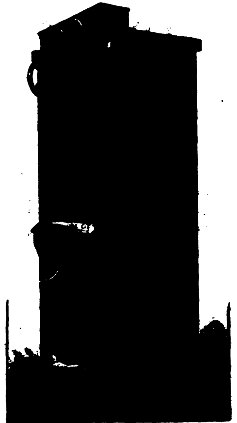
3 SIEVE SCALPER AND GRADER.

ARE THE POPULAR MACHINES FOR HANDLING BREAK STOCK AND GRADING MIDDINGS