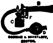
The Boston Atomizer. (Patented.)

Neatly made, strong Black Walnut Box, with convenient Handle, additional, $2.50. Postage 4c.