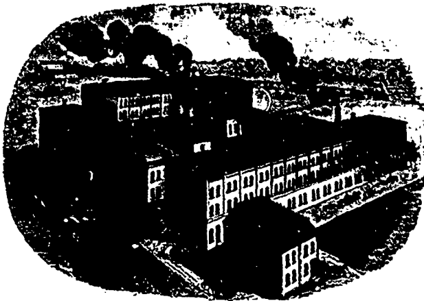
WORKS AT FORT WAYNE, IND.

FOR LONG DISTANCE INCANDESCENT ELECTRIC LIGHTING.