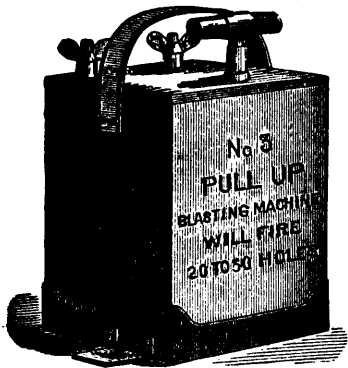
SEND FOR CATALOGUE.