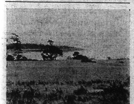
A Metchosin Farm

Thousands of men and some women paid large sums for admission to witness a chamnship prize-fight, and called it good sport. Other thousands would consider themselves degraded by doing such a thing, and would call the others' sport brutal and demoralizing. From which it would appear that sport is a word for which we can give no hard and fast definition for general use, but that, though every one who uses it knows what he intends