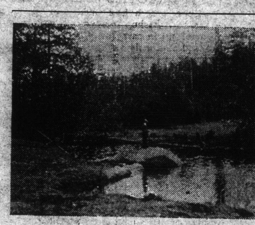
A Colwood Trout Stream

Up-country trips in Vancouver seldom took me more than four days out of reach of