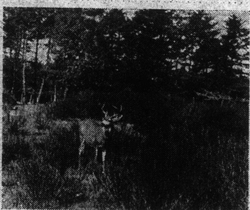
The Blacktail of Vancouver Island

Vancouver Island, 280 miles long, fifty to sixty-five miles in breadth, is one vast stretch of pine and cedar forest, mountain lakes, willow and alder swamp, beloved by blacktail, willow grouse, and wildfowl, intersected by