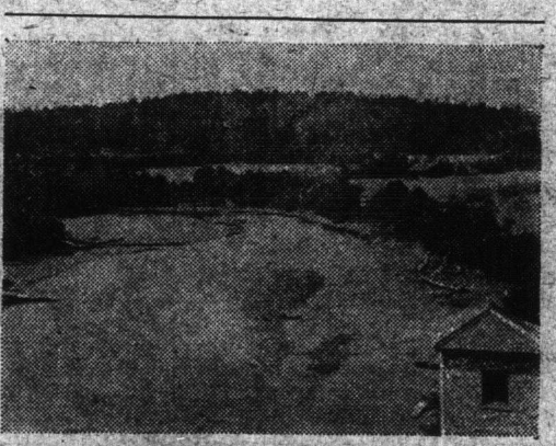
Mouth of Millstream

Out at dawn, cocoa and biscutt, then stillhunting all day on favored feeding and resting grounds, our little party often separating to work both sides of a hill or a ravine or drive a swamp. Each district possessed common points of rendezvous in case we strayed apart too long or the finding and following of had led us in opposite directions. Small huts erected here and there by local sportsmen were very handy in wet weather; the brotherhood of the forest made us honorary members of these storehouses, sleeping huts, and common shelters. Aided by a fawn-colored setter with blue eyes, famous for deer or grouse, also by a crossbred bull mastiff who never forsook a