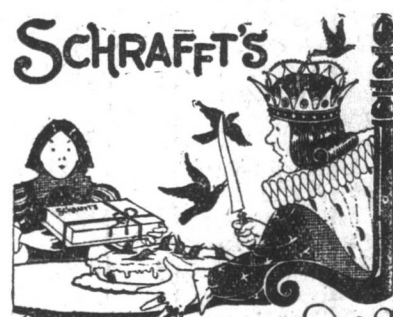
Isn't that a dainty dish to set before the King?

WHAT would those old kings and queens have said if they could have tasted SCHRAFFT'S CHOCOLATES?