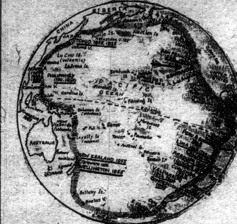
The shaded portion of map above shows the area which was affected by this week's earthquakes, in which Santa Barbara suffered the worst damage.