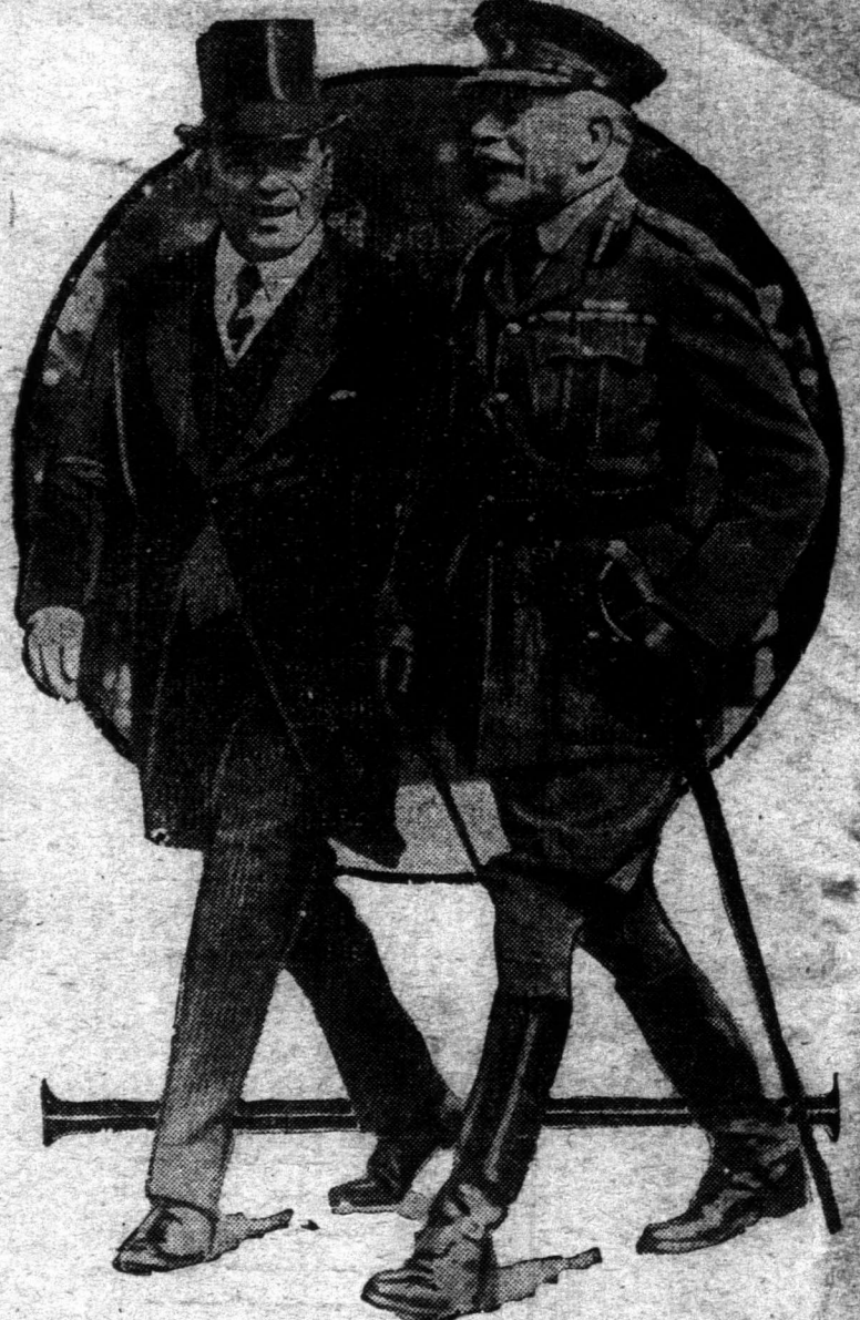
During the course of the formal reception at Ottawa to Lord Bessborough, the Field Marshal and Prime Minister of Canada, he is photographed during a particularly happy mood. To his former commander of the British armies in France he is seen striding along with his typical cavalry gait and wearing service uniform.