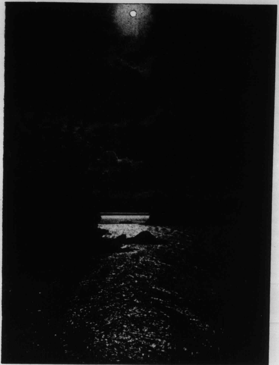
Below—Corner of Elk Lake, a world-famous holiday resort.