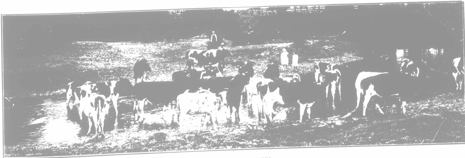
A WESTERN DAIRY HERD.

"BACK TO THE LAND" IS THE CRY OF THE AGE