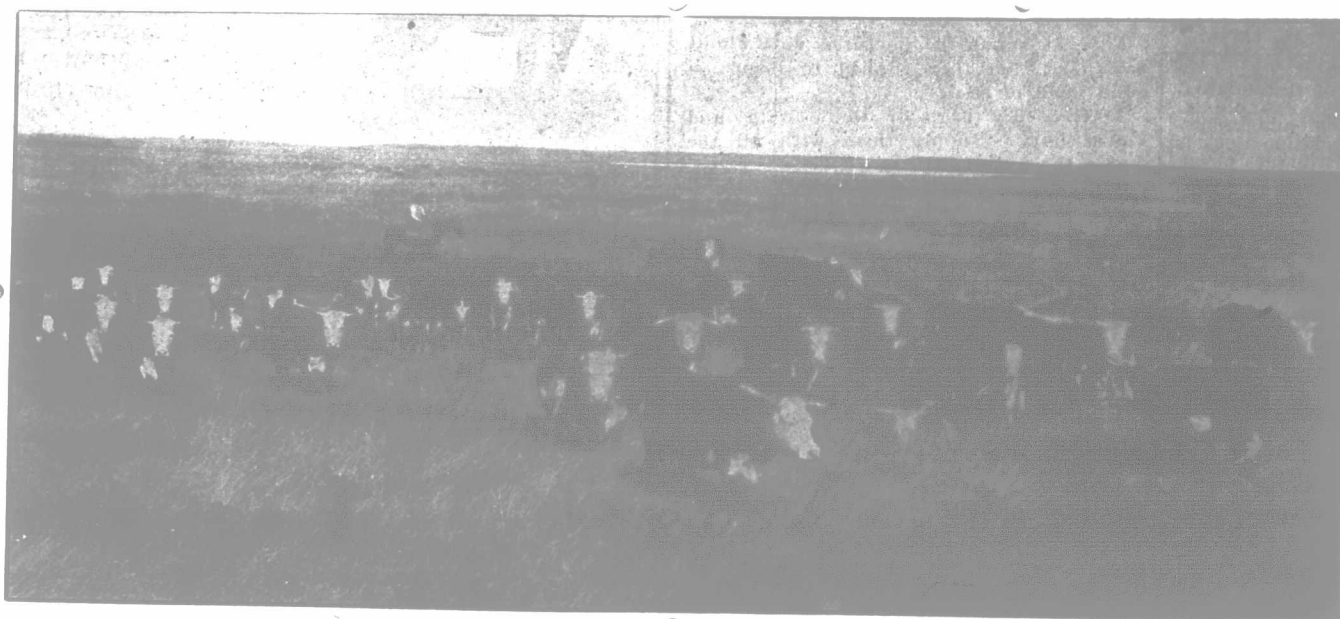
Hereford Cattle, Crane Lake, Assiniboia, Main Line Canadian Pacific Railway.

The Canadian Pacific Railway Company have 12,000,000 acres of choice farming lands for sale in Western Canada. Manitoba and Eastern Assiniboia lands generally from $4 to $10 per acre, according to quality and location. South-western Assiniboia and Southern Alberta lands, $3.50 to $8 per acre. Ranching lands generally $3.50 to $4 per acre. Northern Alberta and Saskatchewan lands generally $6 to $8 per acre.