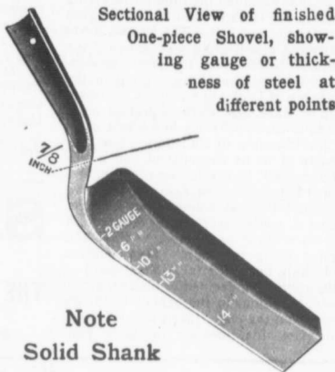
Sectional View of finished One-piece Shovel, showing gauge or thickness of steel at different points