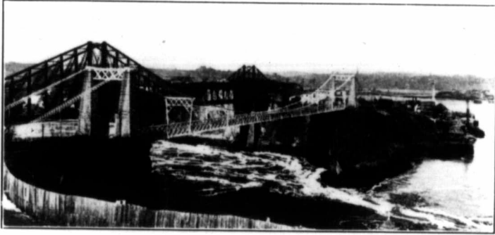
Fig. 14—Bridges at St. John, N.B.