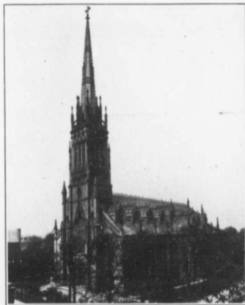
St. Michael's Roman Catholic Cathedral

Built 1847, being the fourth ecclesiastical structure of this name, the original building having been built in 1803