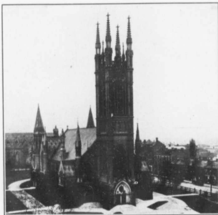
The Metropolitan Methodist Church