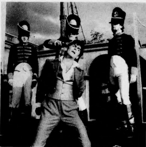
Hey, it's the latest sport on the block! Called the Marine Management Obstacle Contest, these York students demonstrate.