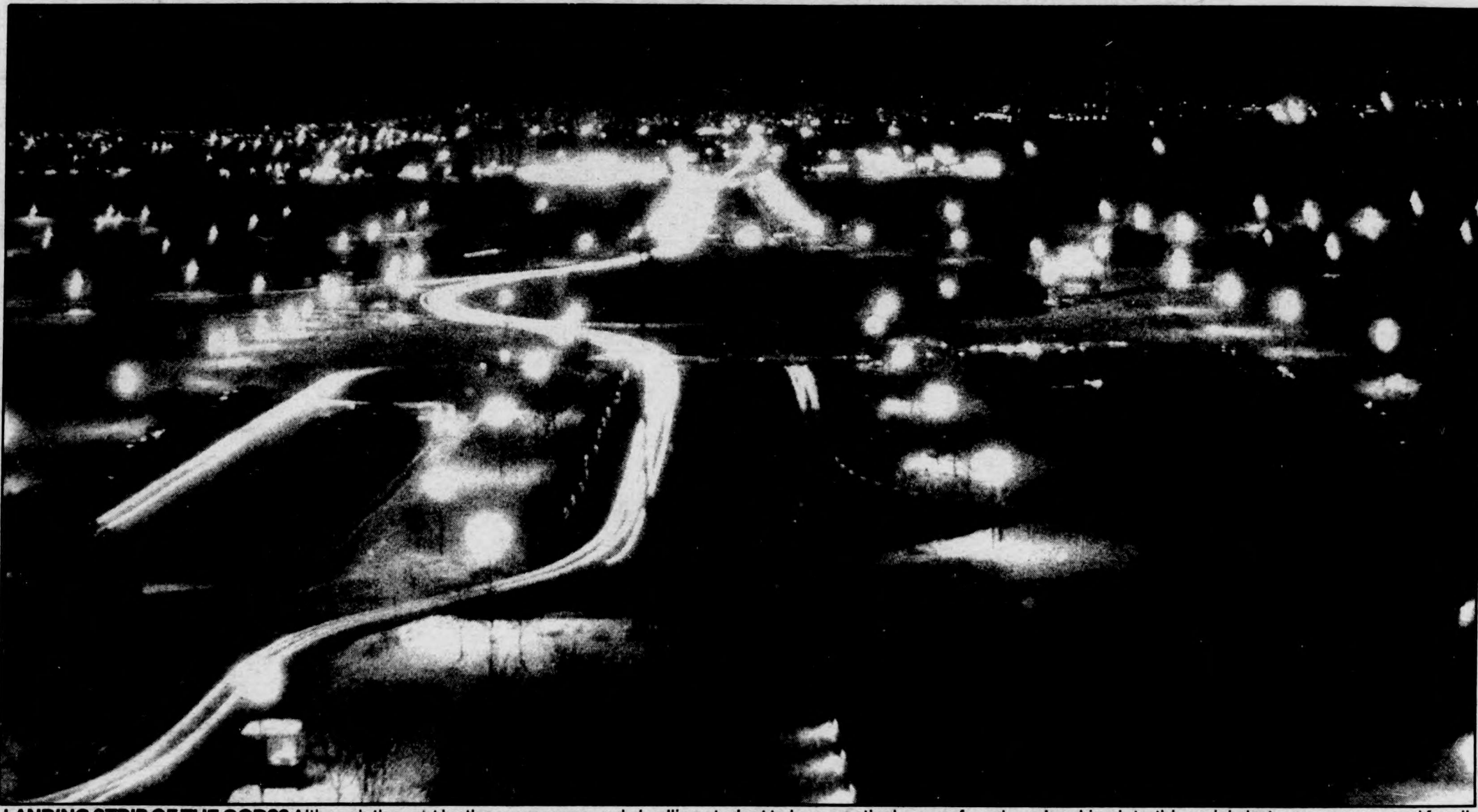
LANDING STRIP OF THE GODS? Although thought by the average ground-dwelling student to be a practical maze of roads and parking lots, this aerial photo proves once and for all that York's Downsview Campus provides a landing facility for extraterrestrial spacecraft who are searching the galaxy for a good game of pinball.