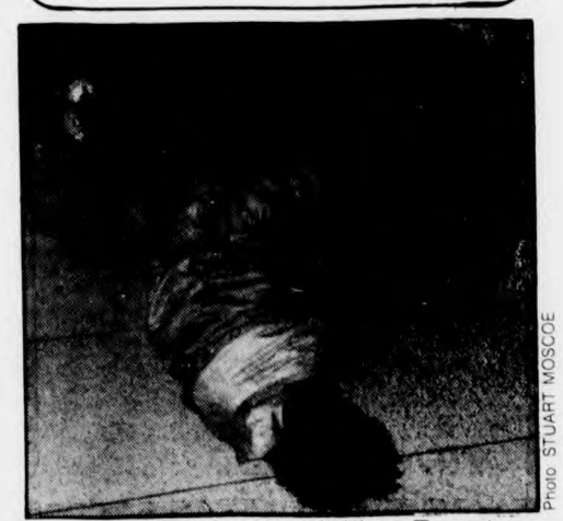
A breakdancing exhibition Tuesday in Central Square.