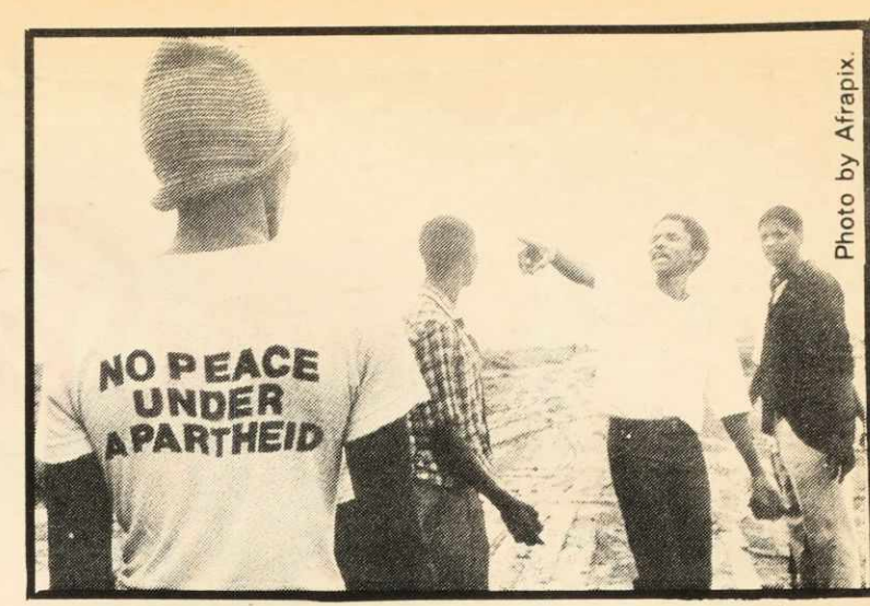
Johannesburg 1986 . . . for more info about Southern Africa today, see Saturday's listings.

Current Economic Problems is part of the Lunch and Learn ser-