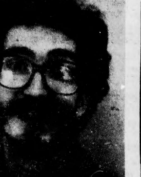
BA God Knows

I was happy to see it brought before the SRC but I was extremely disappointed at the outcome.