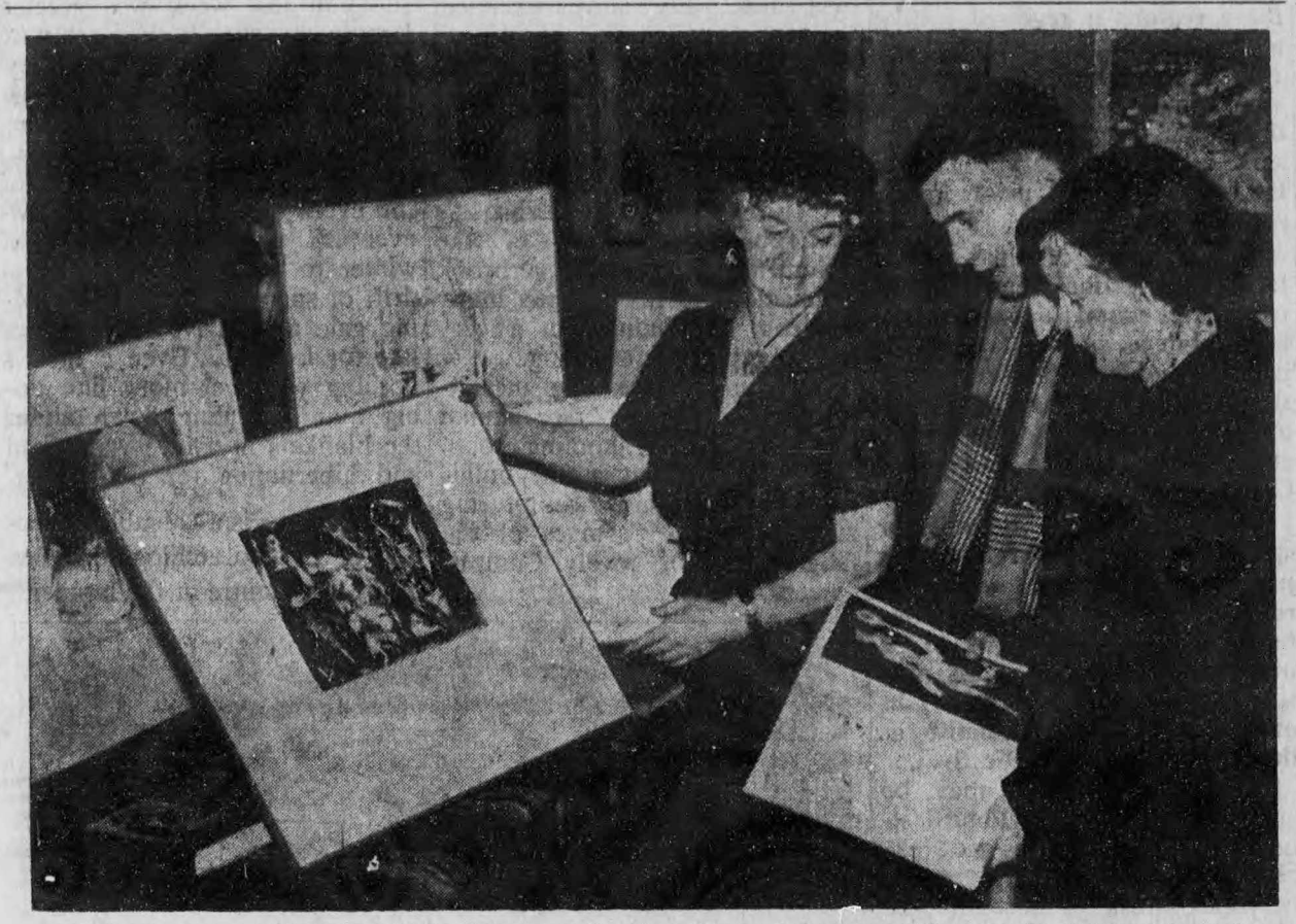
Above are a number of the Picasso sketches that were on exhibit at the University of New Brunswick Arts Centre recently.