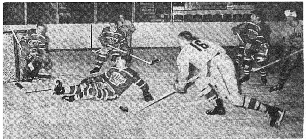
HOCKEY AT THE UNIVERSITY