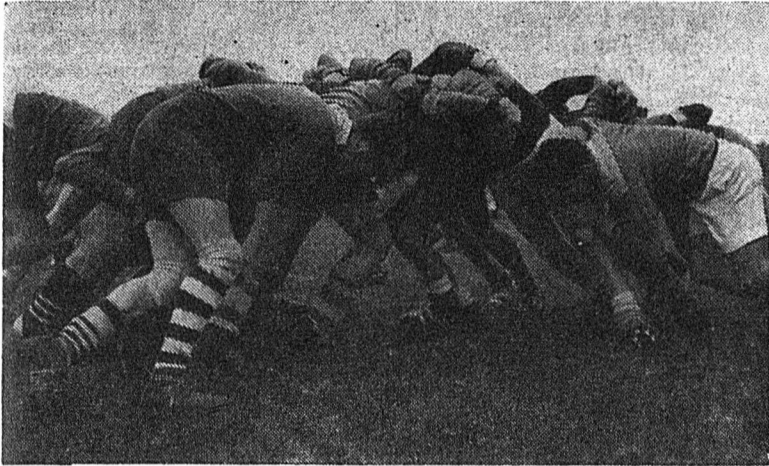
RUGGER AT U OF A