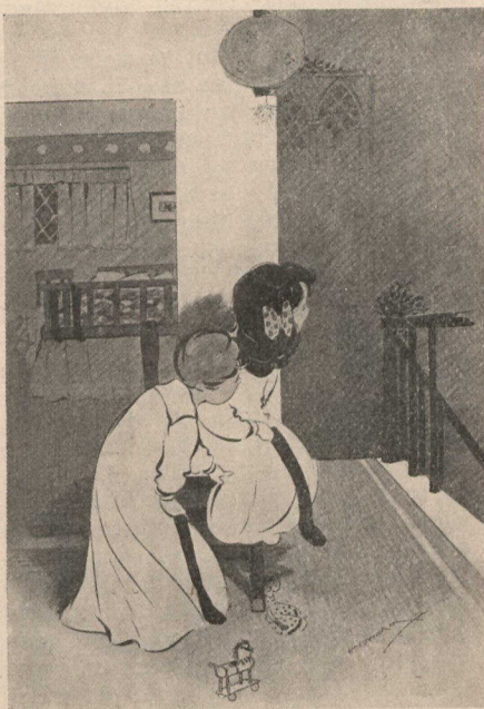
Waiting for Santa Claus.—Windsor Magazine.