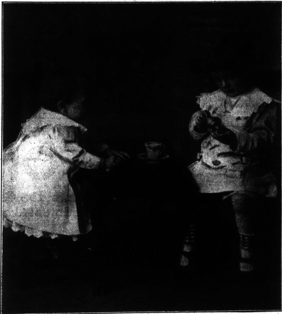
I would far rather see the inside of this toy than eat my supper

Dear Editor—I am a reader of The Western Home Monthly and like the paper very much. I enjoy reading the letters written by the young people. I noticed a letter from a Nova Scotian girl in the November number. I was glad to see a letter from so far east as Nova Scotia, it used to be my home, but it is several years since we left there. Since then I have travelled a great deal. We lived in Cuba a year and about five