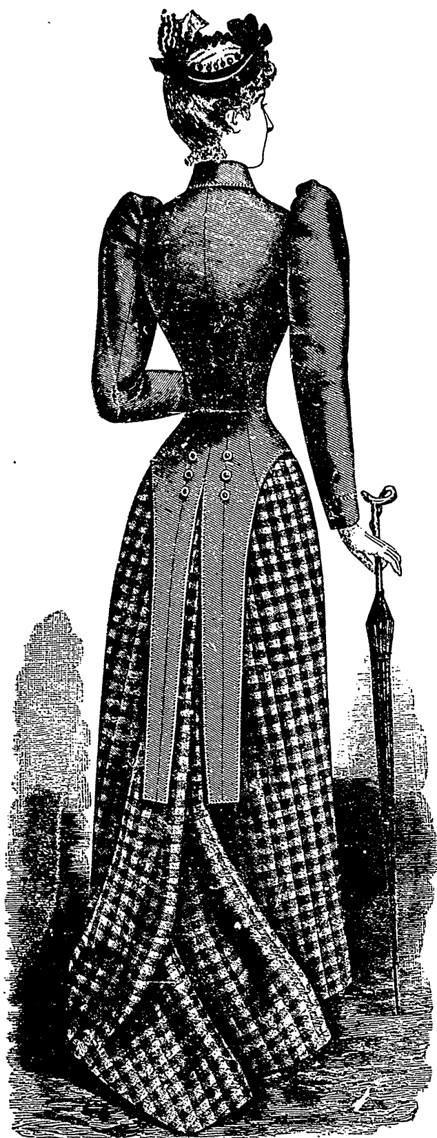
FIGURE NO. 430 T.—LADIES' TOILETTE.—This consists of Ladies' Basque No. 4432 (copyright), price 1s. 3d. or 37 cents; and Skirt No. 4436 (copyright), price 1s. 6d. or 35 cents.