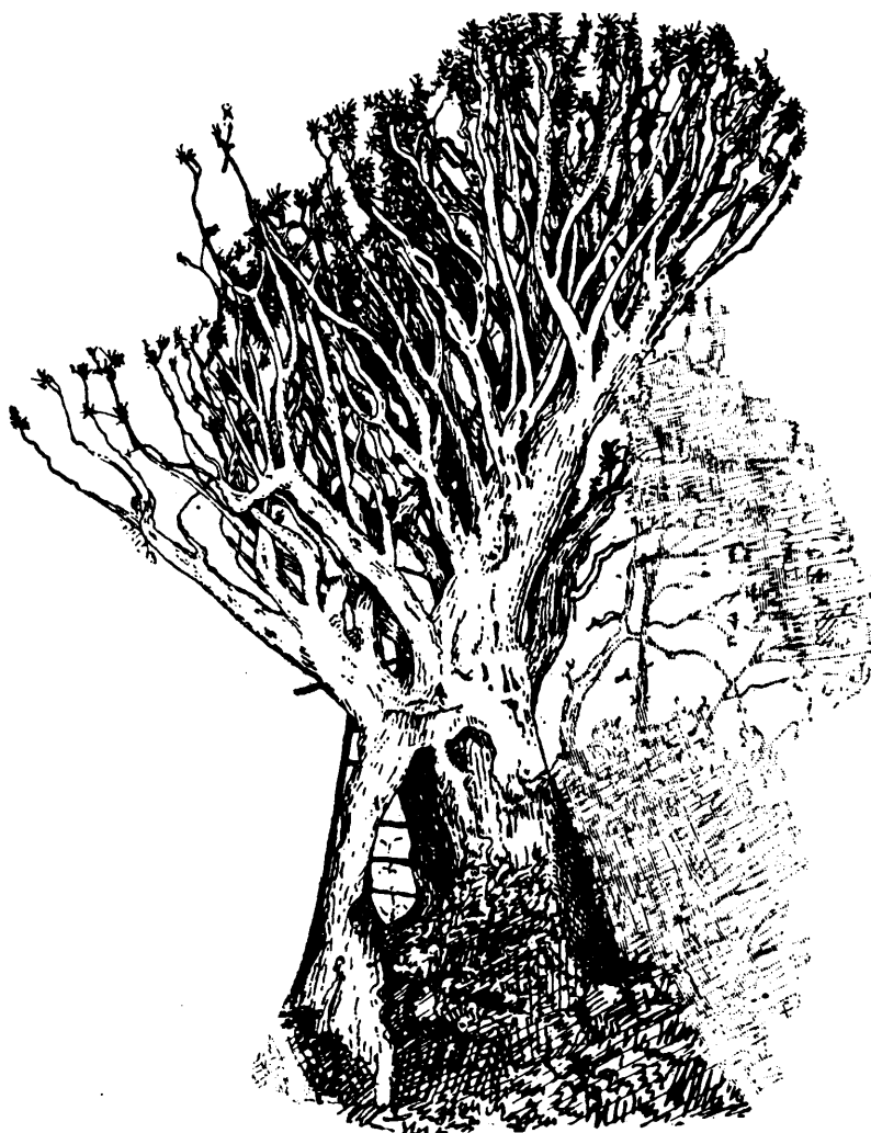
THE OLD OROTAVA DRAGON-TREE DESTROYED BY A STORM IN 1867.

bundle is to convey nutriment, chiefly water, from the roots of the tree to its own particular leaf. While the tree is still young the dots will be found distributed equally over the cross-section; but as it grows older the new dots seem to be produced near the bark, as shown in the following sketch. In fact it is in the zone between the bark and the interior wood (and not in the centre) that the new bundles are formed that cause the trunk to swell in size; and it is to the inextinguishable vitality of this zone that the dragon-tree owes its longevity.