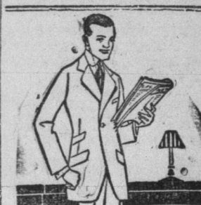
THE LATEST NEWS.

about how Men's Clothes should be made can always be obtained here.