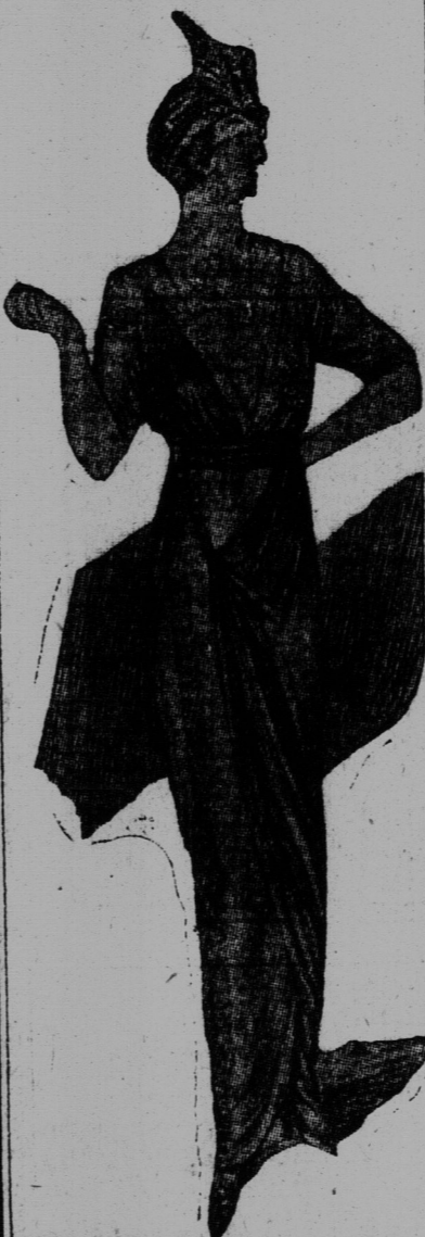
This is of satin with nylon over lace. It is lined with silk throughout.