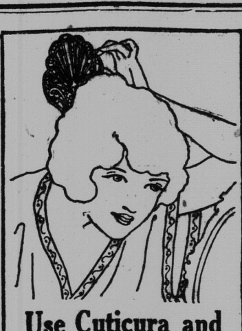
Use Cuticura and Have Lustrous Hair Regular shampoos with Cuticura Scap will keep your scalp clean and healthy. Before shampooing touch spots of dandruff and itching, if any, with Cuticura Ointment. A healthy scalp means thick, glossy hair. icap 25c. Giutment 25 and 50c. Taleum 25c. Seld hroughout the Dominion. Canadian Depot ymans. Limited, 344 St. Paul St., V., Mostreal. Cuticura. Soap shaves without mug