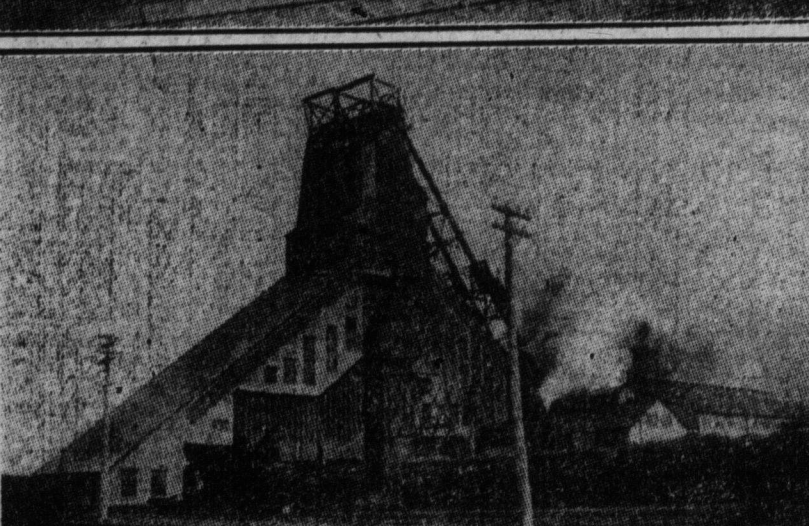
DOMINION NOS. 2 AND 3 COLLIERIES