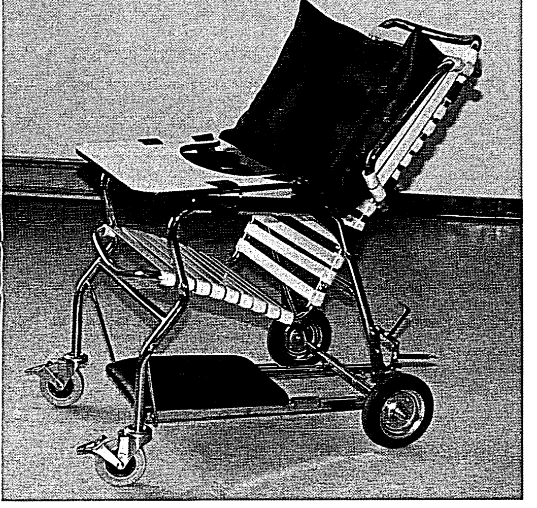
The agitated patient or stroke victim can be transported with ease and comfort in the deep-wedge Wing Chair Run-A-Bout manufactured by Broda Enterprises Inc.