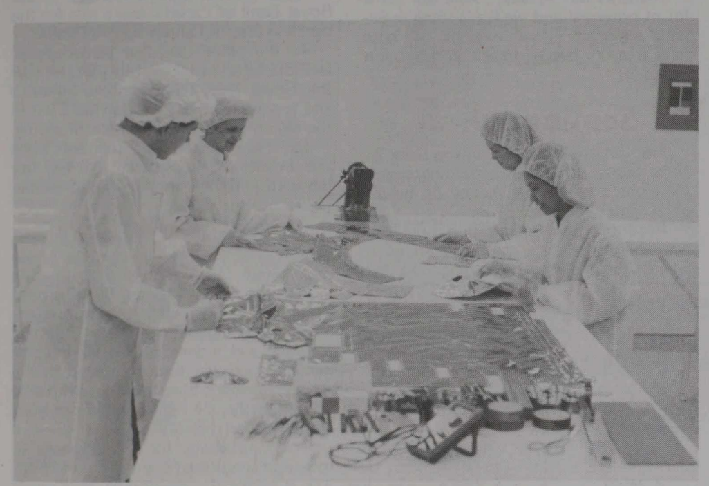
Fell-Fab clean-room solar blanket production for the European satellite program.

Tragic fires in passenger aircraft have aroused the interest of Mobil Oil Singapore in a product developed and patented by Canadian company Fell-Fab Products.