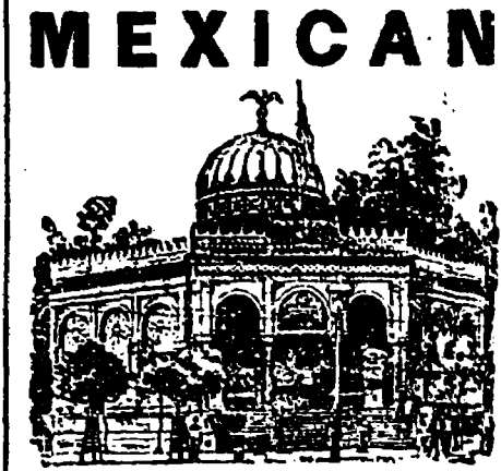
Morisque Pavilion, City of Mexico, where drawings take place.

If your Grocer does not keep our ALES, order direct from the Brewery. Telephone 1168. THE MONTREAL BREWING CO., Brewers and Maltsters, corner Notre Dame and Jacques Cartier Streets.