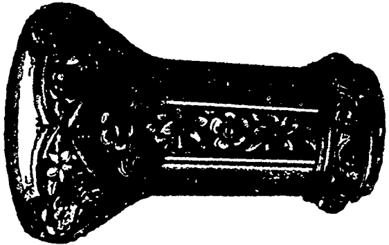
No. 203—1 in. 16k. $21.00.