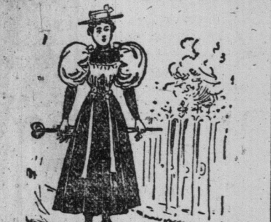
"A Picture of Health and Activity."