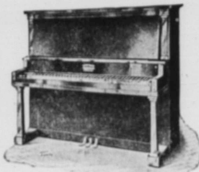
STYLE B PIANO

If after you and all the friends you wish to consult are satisfied after a month's trial that it