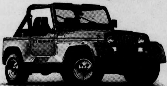
Jeep YJ The fun-to-drive convertible From $11,825***