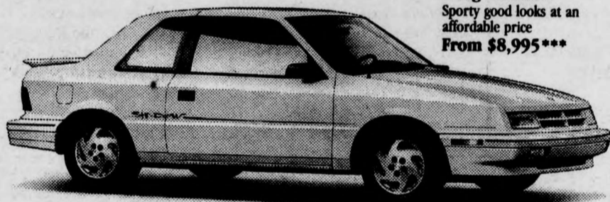
Plymouth Sundance/ Dodge Shadow Sporty good looks at an affordable price From $8,995***