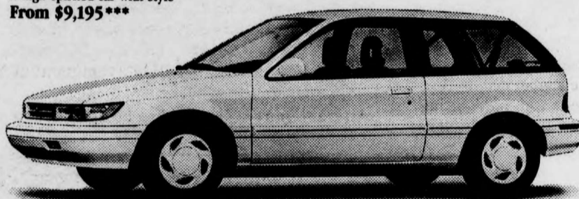
Plymouth Colt 200 A high-spirited car with style From $9,195***

You've worked hard for your education. And now Chrysler wants to start you on your way with incredible savings on your first new car or truck.