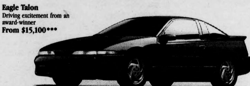
Eagle Talon Driving excitement from an award-winner From $15,100***