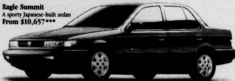
Eagle Summit A sporty Japanese-built sedan From $10,657***