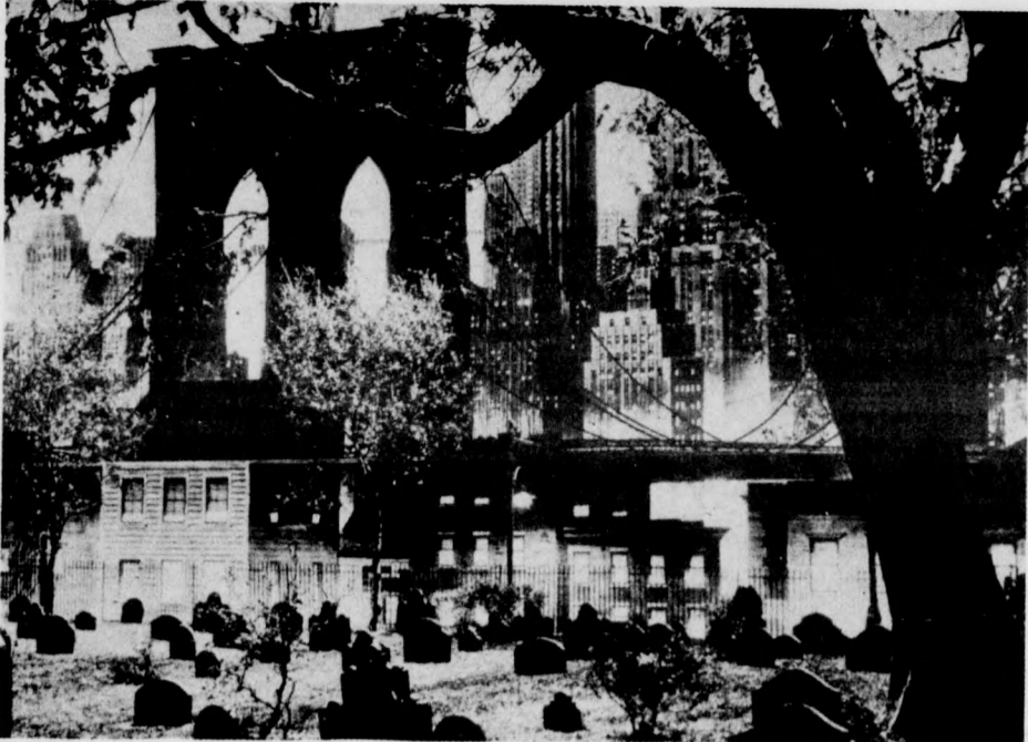
Cary Grant, 1941-44

This film was almost a literal transcription of its brilliant theatrical model, although certain minor roles were rewritten and expanded to accord with the star system (e.g. the character played by Cary Grant). In the original, the cream of the jest lay in the fact that a character who resembled Boris Karloff was played by... Boris Karloff; Capra cast Raymond Massey in the role, to general bewilderment. Critics remarked that the screen version was somehow more gruesome than that of the stage, but otherwise accepted it as an efficient though over-energetic transcription. It is more crude, though, than the later State of the Union, itself by no means a true adaptation to film form either, but done with greater skill and subtlety. For a more esoteric, but highly questionable, interpretation of Arsenic and Old Lace, see Parker Tyler, Magic and Myth of the Movies.