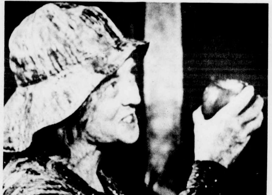
Glenn Ford, 1962

This was a remake of Frank Capra's Lady for a Day. This film was a fairy tale by Damon Runyon. Its complete divorce from the American reality amidst which it pretended to occur was happily signalled by Richard Watts, Jr.: "There is something as frank and unashamed about the straightforward sentimentalism of Lady for a Day as there was about the gallant rowdiness of Miss West's She Done Him Wrong. If the cinema is to go in for the unembarrassed use of the smile between the tears, it seems to me much better to drop all pretence and shoot the works." It now appears that its popularity derived from its gallery of characters whom American audiences took to their hearts, and who were to them as vividly enchanting as the inhabitants of Disneyland or Chaplinland. Historically interesting are the first hints of that "fantasy of good will" which was to become the Capra-Risking major theme.