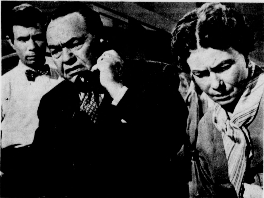
Frank Sinatra, 1959