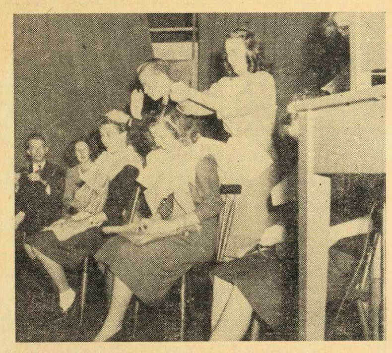
When I say "Hold it!" Everybody hold! The cameraman moves in on a sophomore, or perhaps we should say, freshette brain-wave.

DALHOUSIE Frosh breathed an disregard of rules, insubordination, audible sigh of relief on Friday last in the Gym when the announcement came over the mike, "Frosh you are once again humans!" In other words they doffed their regalia, plus a timid, subservient look, automatically brought on at the sight of a sophomore, and became fullfledged "stoodents" of Dalhousie.